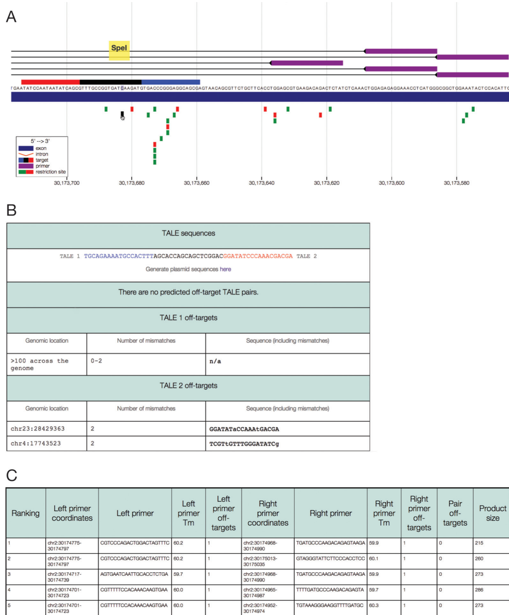
Figure 2. CHOPCHOP provides detailed information about each CRISPR/Cas9 and TALEN target site. (A) The detailed information page provides a zoomed in view of the target locus with visible DNA sequence, primer options (above the gene, purple) and restriction sites (below the gene; green if unique in the region, red if not). In TALEN mode the target site is color-coded; TALEN 1 is blue, the spacer is black and TALEN 2 is red. (B) Information is provided about predicted off-targets: the genomic location, number of mismatches and location of mismatches within the sequence. (C) Information is provided about the primer designs, including the primer sequence, T_m and product size.

is available, containing annotations of the target site and primer designs.